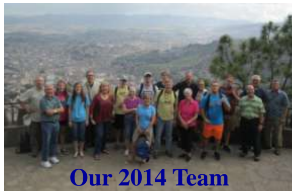
Our 2014 Team

As partners with these Christian brothers and sisters, we invite you to join us in worship on Sunday, June 5 (at the single 10 a.m. worship service) as we dedicate all the gifts the congregation has given for the mission, and ask God's blessing as we commission the mission team.