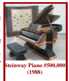
Steinway Piano #500,000 (1988)