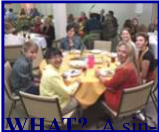
WHAT? A single worship service followed

October 7 February 3 June 2 November 4 March 3 July 7 December 2 April 7 August 4 January 6 May 5