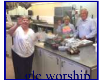
Single worship by a fellow-

October 7 February 3 June 2 November 4 March 3 July 7 December 2 April 7 August 4 January 6 May 5