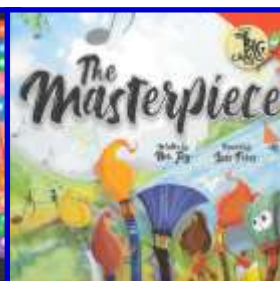
The Masterpiece (One Big Canvas)