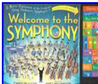
Welcome to the Symphony